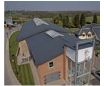
Below and right: Carrwood Park, Leeds. Meta-SlatePlus roofing system with barrel rooflights to a new building during and after installation with view from inside showing underside of AS35 panel.