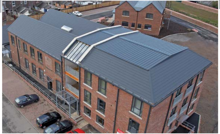
Above: Telford House, Riverside View, Carlisle. Meta-SlatePlus roofing system to a conversion of an existing building.

The screws are fixed through the overlap between panels so that the screw is driven through two thicknesses of the metal top sheet (fixed at a maximum of one per metre of panel length). The frequency of fixing can be increased around the edges of the installation or where special detailing is required.